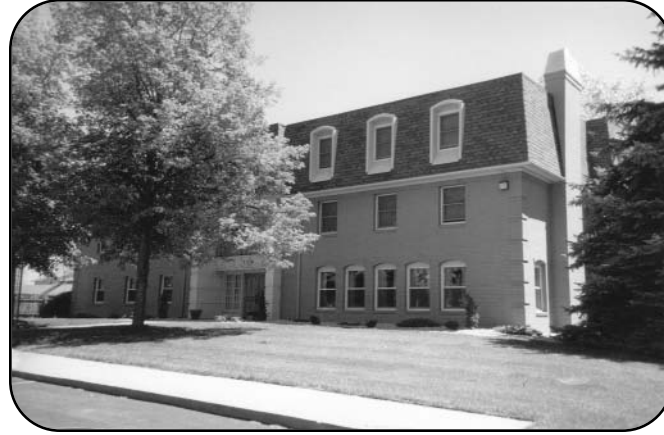
The J.R.R. Tolkien House two blocks west of the CSU campus