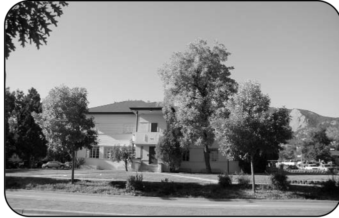
The C.S. Lewis House across the street from CU Boulder

This fall marks the beginning of our freshman Bridge Program in partnership with Northwestern College of St. Paul, Minnesota. The program is designed for Christian students who plan to earn their degree from a state university, but want to begin with a smaller, mentored experience with Christian instructors. The program includes core courses in Christian studies, and electives in the humanities. Here's our line-up of courses for this year.