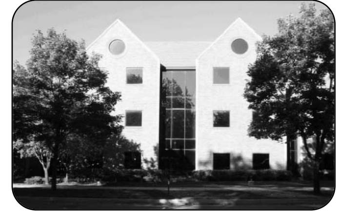
The Young Life Building downtown Colorado Springs

Colorado Springs is not a typical university town. While the University of Colorado, Colorado Springs is the fastest growing campus in the state, it is primarily a commuter campus, drawing students from the half million people who live in the area.